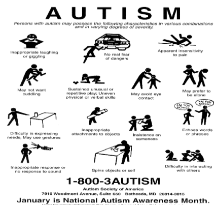
Figure 1. The Characteristic of People with Autism [2]

It's no longer a secret that some people around are having special needs, whether given since their birth or starts at any time; including people with Autism Spectrum Disorder (ASD). Autism Spectrum Disorder is a term that is used to explain neurological problems/disorders which affect mind, perception and concentration. Nowadays, found on average the population of autism is 1 in 100 children, while the previous estimate was 1 in 150 children and older era people think autism is 1 in 500 children [1]. Other trigger factors of the increasing autism population such as quoted from Thedailygreen.com, Tuesday (6/10/2009) is an environment that has been exposed to mercury or other heavy metals, contaminated water, as well as the use of pesticides or antibiotics.