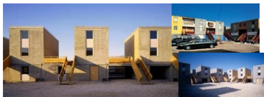
Figure 4. Perspective of Quinta Monroy, Incremental housing.