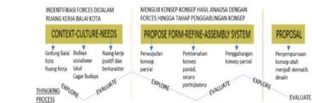
Figure 2. Force based framework that used in thesis design [6].

Therefore, in the design this time the forced based method was chosen from Plowright as a design method and process (Figure 2). In this thought comes a thought called emergent thinking, where this thinking style showed how to see design as a result of thinking process to solve a problem or urgency. In this thinking style, thinking about how academics and successful people can work together to overcome challenges through developing design quality sustainability strategies.